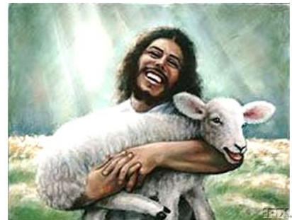
Doubtful that sheep would be smiling. Matter of fact, I don't think sheep ever smile. Kinda creepy.