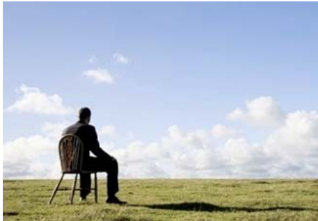
Not the church. Not even “a” church.

In addition to that, the phrase “You don’t have to go to church to be the church” is also rooted in a poor misunderstanding of God’s purpose and plan for His body. The word ekklesia means “assembly.” It is not a personal, autonomous identity, but it is a corporate identity. You are not the church. You are a part of the church.