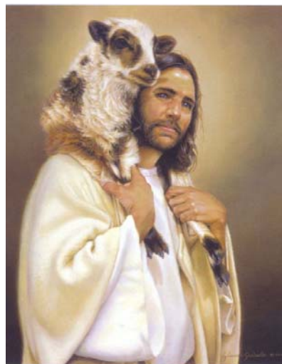
Russell Crowe/Eddie Vedder as Jesus.

In today's age, we view a shepherd as someone who nurtures, cares for, and cuddles with lambs. However, in the New Testament's day and age, shepherds were known to be strong, healthy, manly, tough, and in top shape. They had to go against wolves to protect the flock, and when there was a disobedient sheep, a good shepherd would break its legs to teach it to be obedient and stay within the flock. These men endured the cold, the night, and isolation. A wealthy man who owned a large flock would entrust only certain men as shepherds to oversee the whole flock , not just tend to a select group of sheep with needs. These men had to be of noble character, honest, and full of integrity to ensure that these men wouldn't abandon his flock at the sign of trouble, or even steal or sell the flock unlawfully. 840